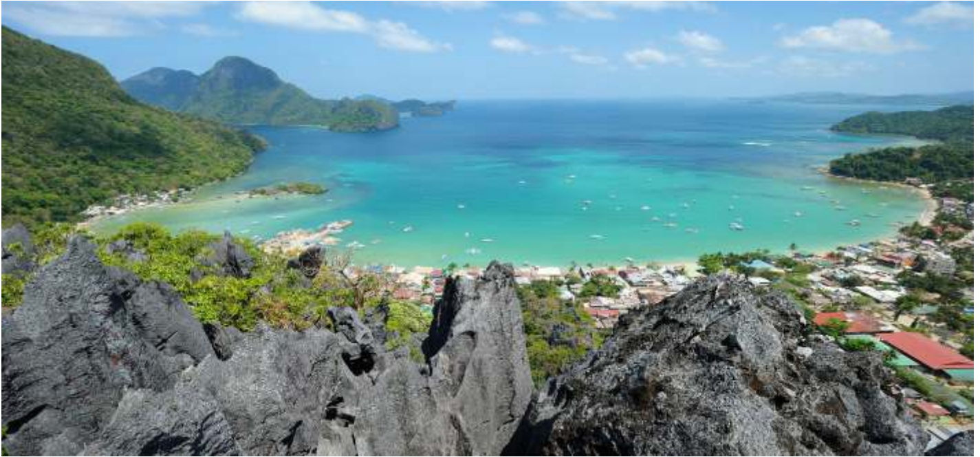
Photo: El Nido